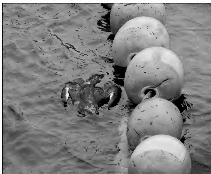
FIGURE 3. New efforts to understand seabird bycatch are concentrating on artisanal gill net and purse seine fisheries distributed in Chilean waters. Top: Gillnets in south-central Chile overlap with seasonal migration and juvenile dispersal of penguins, such as this juvenile Magellanic Penguin. Bottom: Purse seines operate in breeding and feeding areas of endemic species such as Pink-footed Shearwater.